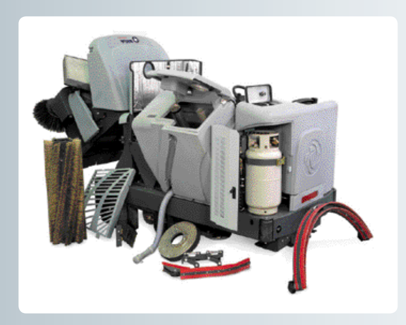
No tools needed in order to access key components. Maintenance is fast and simple