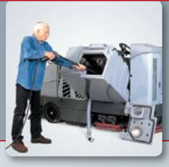
The tip-out recovery tank makes cleaning easy and reduces bacterial build-up