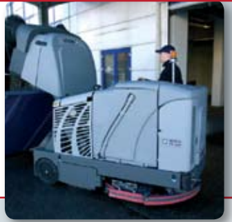
The hopper is easily emptied without restricting the operator's visibility thanks to its smart off-set design