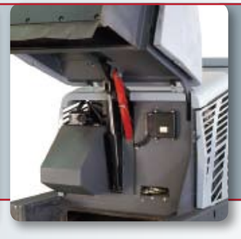
A unique safety block system for the hopper can be activated by the operator from the seating position