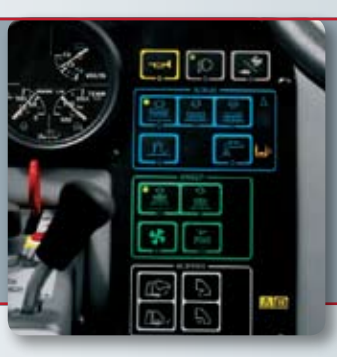
Variable scrub deck pressures. With the choice of 55, 110 and 180 kg down force, even the heaviest ground in dirt is removed efficiently.