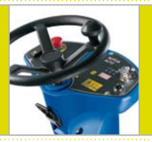
Adjustable steering wheel for excellent operator comfort

The FLOORTEC R680 is indeed a high capacity dust-free sweeper. With a working width of 1050 mm, a powerful vacuum system and a hopper size of 130 litres you can sweep large areas of floors before emptying is required.